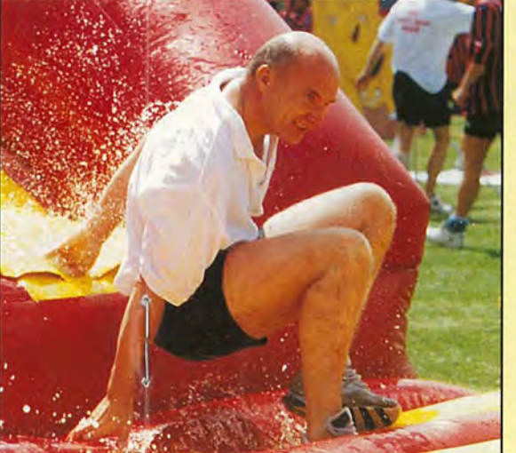
A safe landing at the foot of the 'Over the Top' inflatable slide, with a drenching for those taking part.