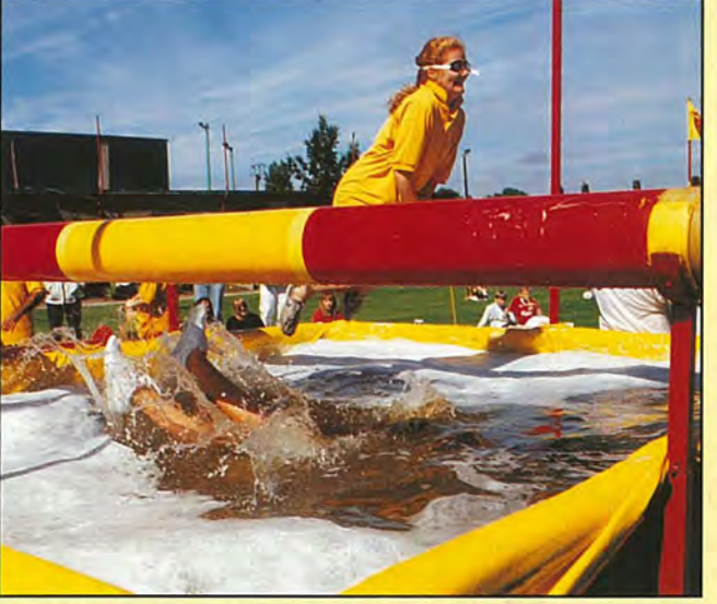
In at the deep end for this victim of the slippery 'Poles Apart' game, while a team-mate inches her way forward.